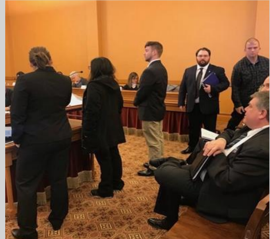
Young leaders and former foster care youth testifying before legislators.