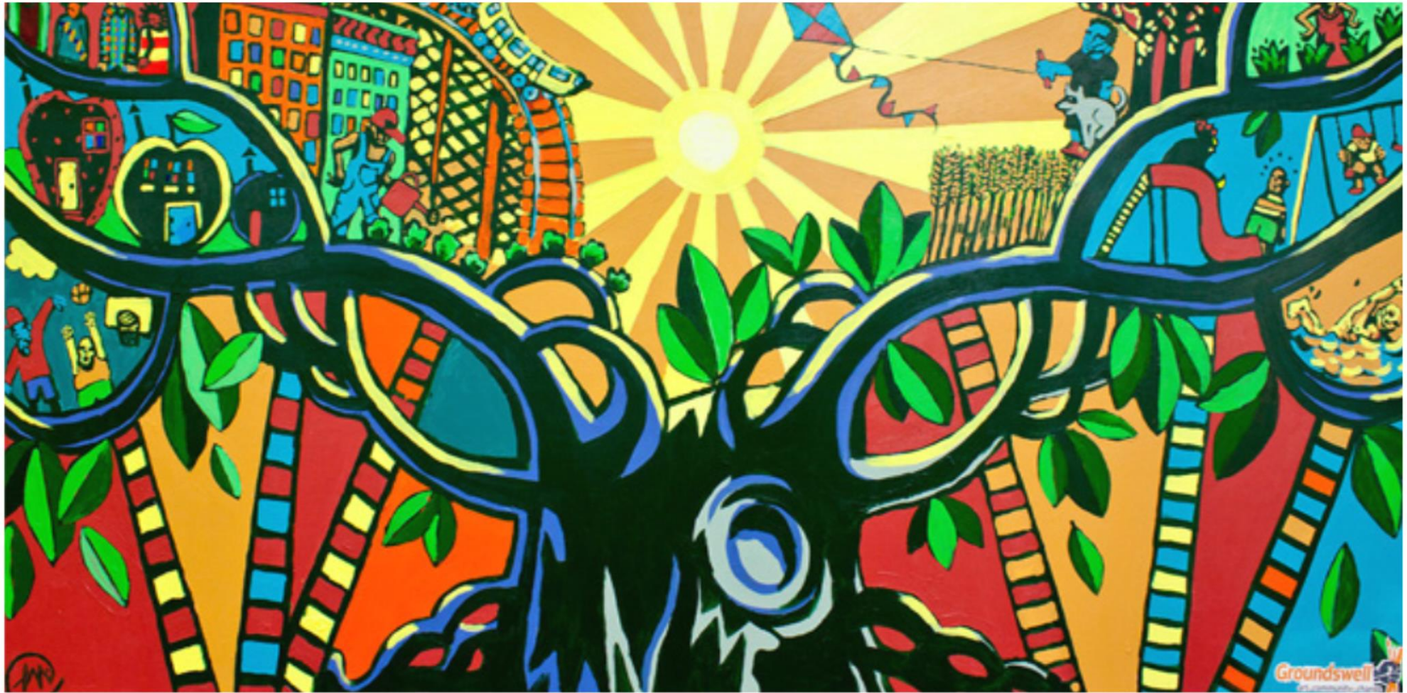
"Visions of a Healthy Community" youth mural, Groundswell NYC © 2012