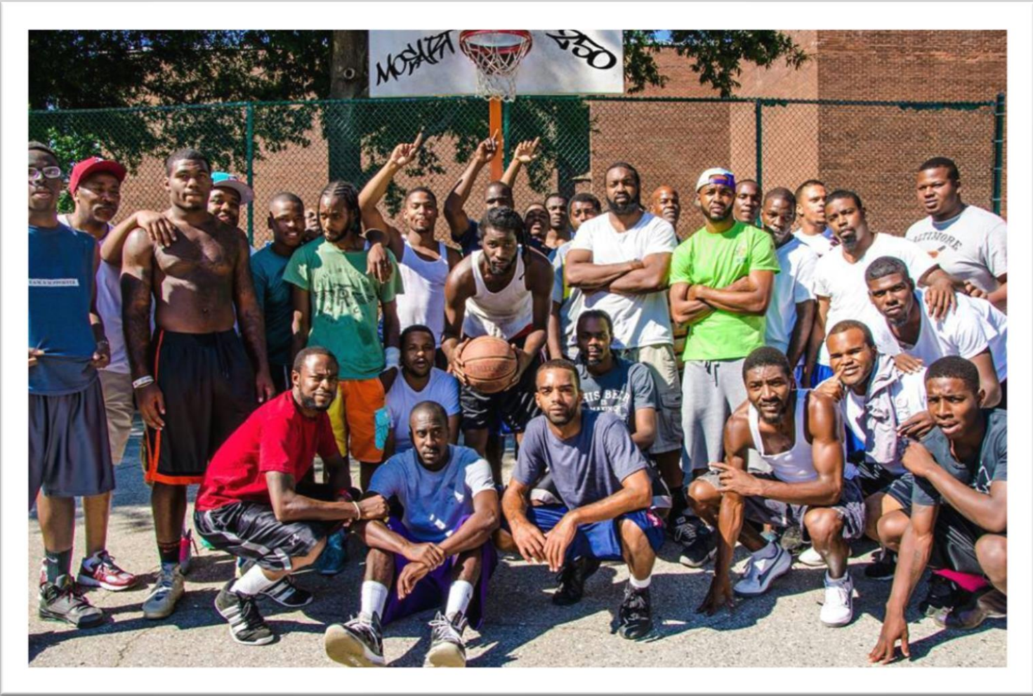
Youth engaged with Meraki Community Uplift pose for a photo on the court.