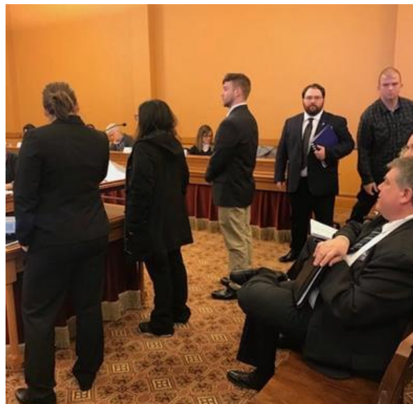
Young leaders and former foster care youth testifying before legislators.

In February 2018, a group of lawmakers and child welfare stakeholders presented to the Kansas legislature’s Child Welfare System Task Force to share recommendations to improve the safety and well-being of children in the child welfare system. Young people who had been through foster system stood alongside independent advocacy organizations to inform the work of the task force, sharing stories of their personal experiences as well as their perspectives on what’s needed for change. At the end of one young person’s presentation, one of the taskforce members noted that the testimony was “one the best I’ve heard in my nine years of service.” 30