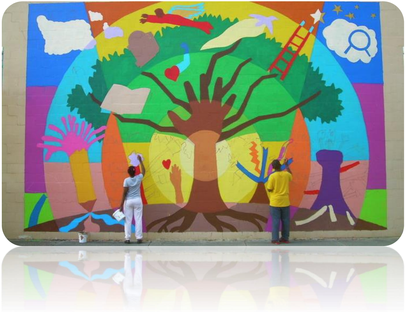
Youth mural in Greenville, Mississippi

Since the birth of modern American philanthropy at the turn of the 20th century, funders have sought effective strategies to improve health and social welfare. 13 14