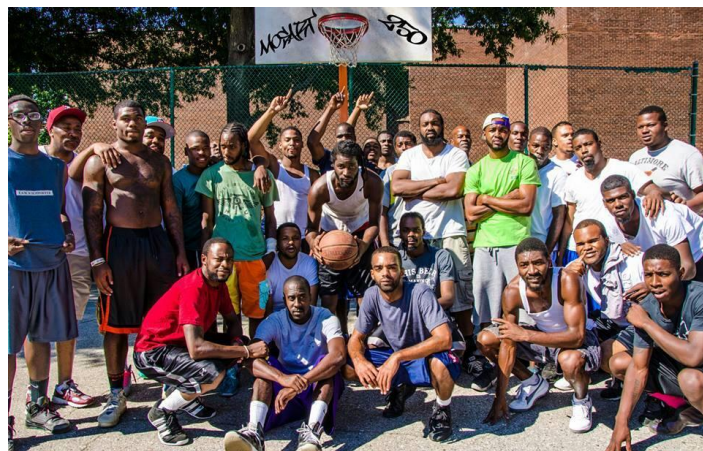
Youth engaged with Meraki Community Uplift pose for a photo on the court.

Young people and their families in the Oliver neighborhood of East Baltimore have seen more than their share of challenges in recent decades. One in three homes in Oliver is vacant. Gun violence has claimed the lives of over 20 young people in recent years. Disinvestment resulting from a long history of racial segregation, a drug epidemic, and local violence serve as ongoing threats to the wellbeing and safety of residents. 33